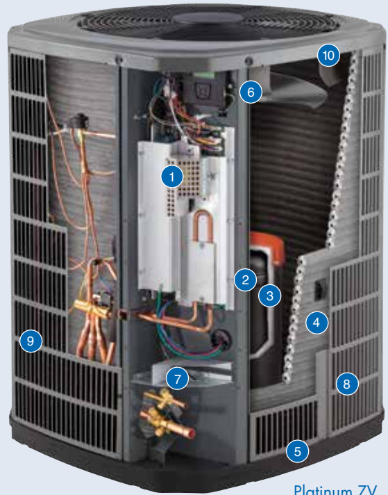
Platinum ZV Heat Pump shown

Features and components may vary by model and are shown for illustration purposes only. As part of our continuous product improvement, American Standard reserves the right to change specifications and design without notice.